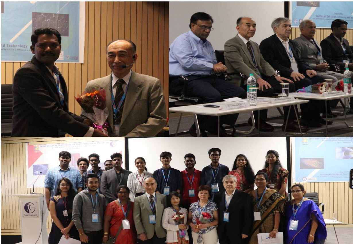
Few photographs of ICMM 2K19