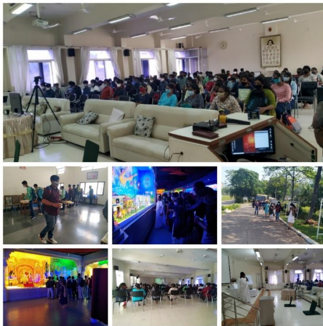
Shanthi Sarovar, Gachibowli

Students went on a tour to Rama Chandra Mission Tumkunta. Students learnt a few Yogasanas and practiced meditation. At Shanti Sarovar, Gachibowli they understood the need to have and practice universal human values. They participated in Community Service at Golden Temple, Banjara Hills. As part of industrial tour, students visited Akshaya Patra, Kandi to understand food processing and logistics.