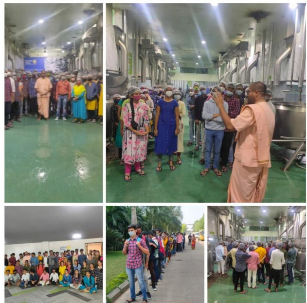
Akshaya Patra, Kandi