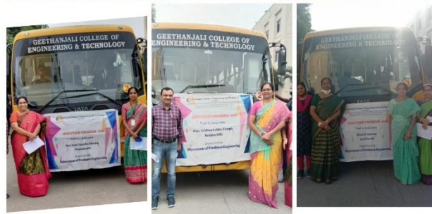
Visits to Local Areas